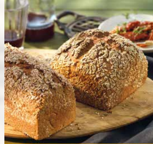
Potatoe Wholegrain Bread